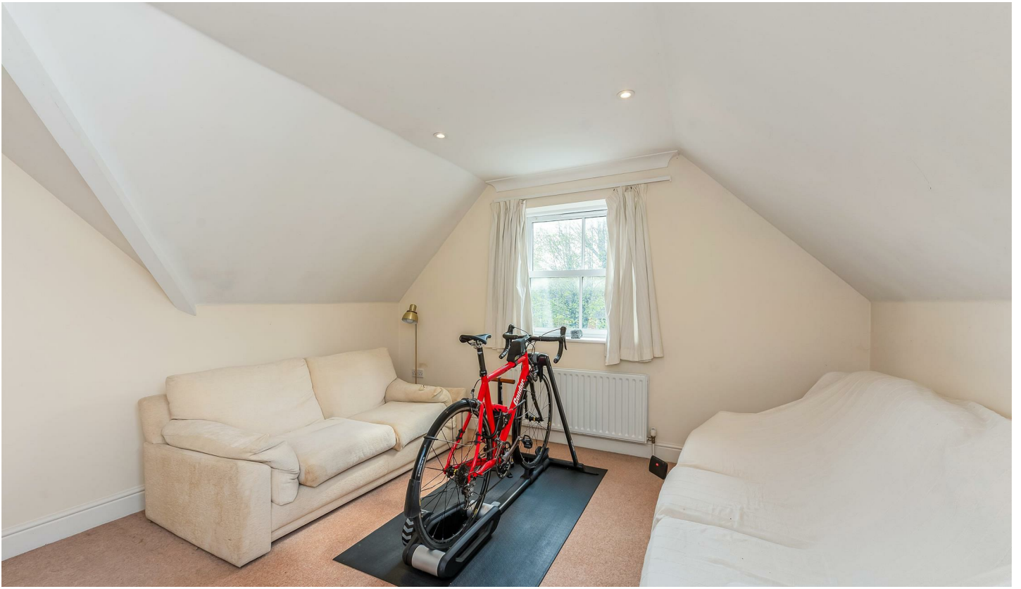
Full Description A two bedroom top floor flat