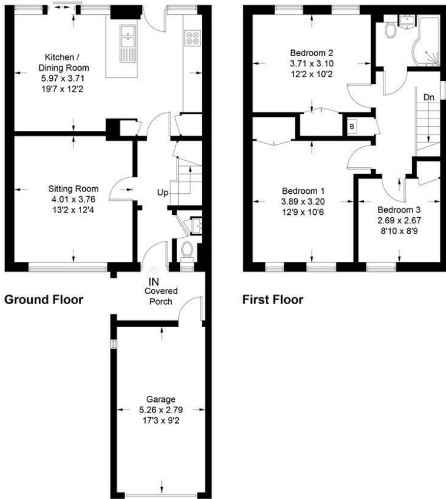
Illustration for identification purposes only, measurements are approximate, not to scale. floorplansUsketch.com © (ID1070926)